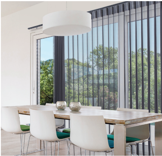
Left or right stack