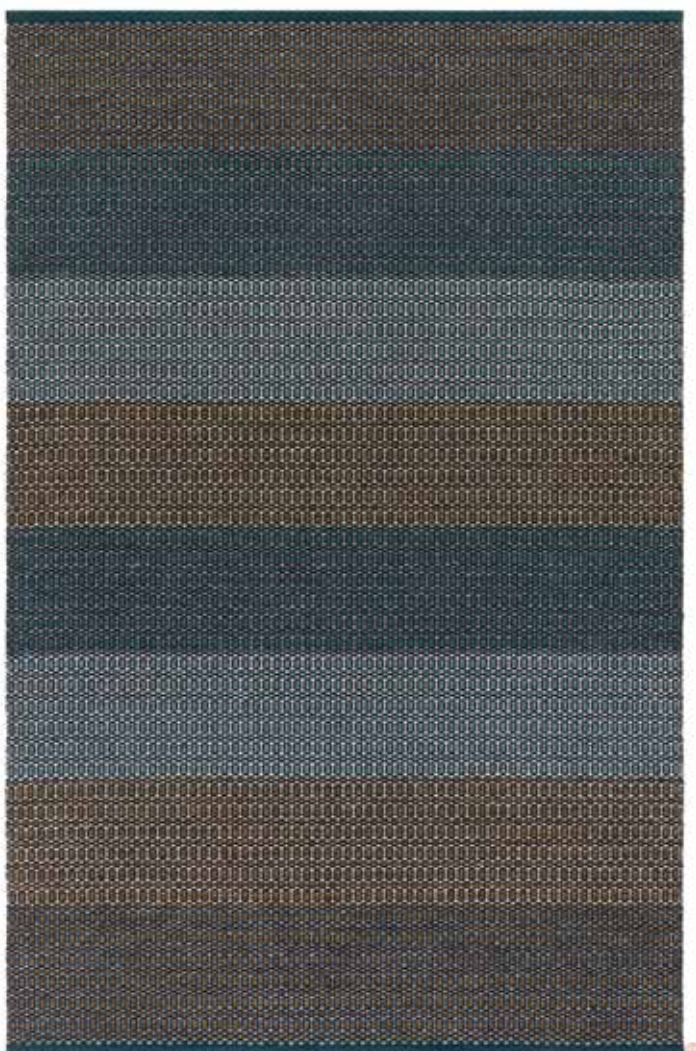
Rug 170x240 cm, Amber 801

Showrooms in MILAN | NEW YORK | STOCKHOLM | GOTHENBURG