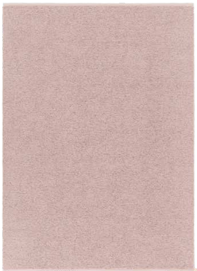
Rug 200x300 cm, Pink Maccaron 610