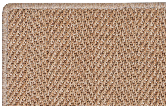
Palma Icon Sand