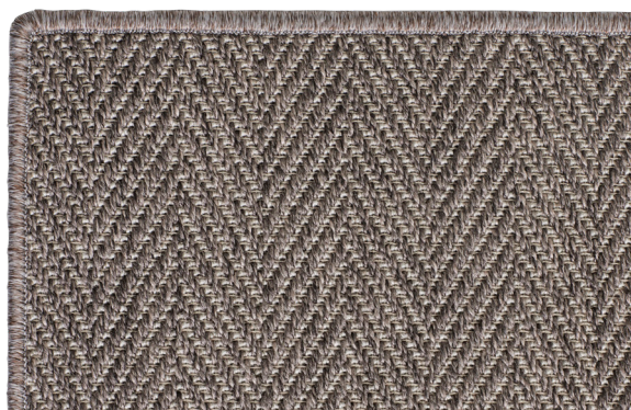
Palma Icon Carbon