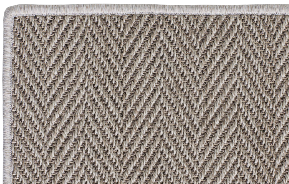
Palma Icon Cinder