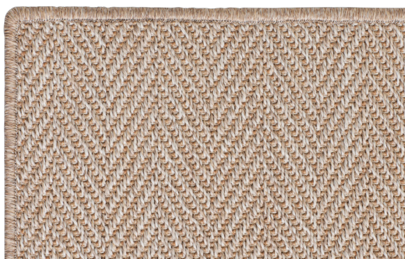
Palma Icon Chalk