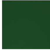
B02 VERDE PRATO - OPACO