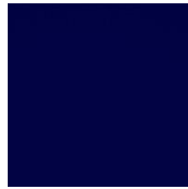
B93 BLU OLTREMARE - OPACO