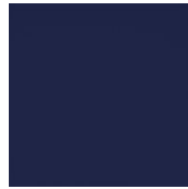
B94 BLU COBALTO - OPACO