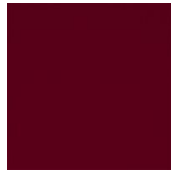
B11 ROSSO SCURO - OPACO