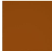
B10 ARANCIONE BECCO D'OCA - OPACO