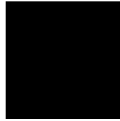
B59 NERO - OPACO