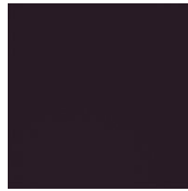
B18 VIOLA MELANZANA - OPACO