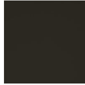
B22 MARRONE BUNGEE - OPACO